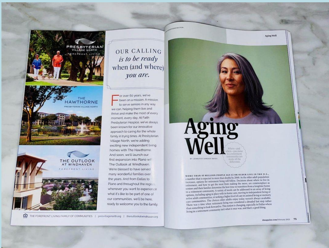
Forefront Living is prominently featured in the latest issue of D Magazine in an ad and an article about senior living. Read the article here.