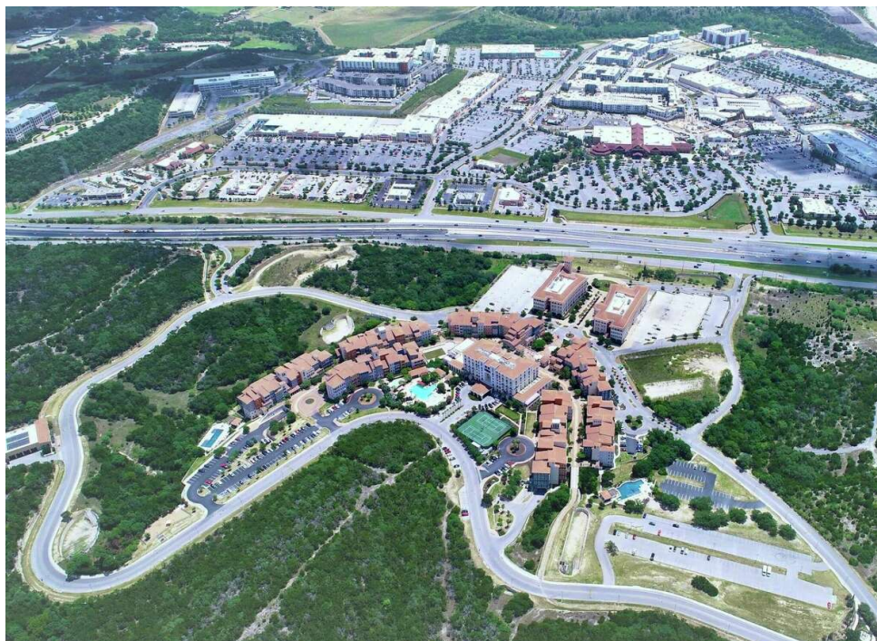
The complex will be built just north of the Éilan mixed-use development.